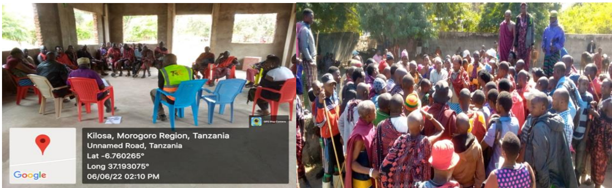
Photo 3: Public meeting with Maasai Community residing along the project corridor

Public meetings with vulnerable groups were conducted to share project information to IP groups and understand their views and concerns regarding the project. The discussed issues were related to safety, provision of crossings and inclusion of IPs in project benefits. Consultation topics, the asked questions and the responses have been presented in table 1.